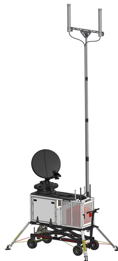
Mast shown in deployed position

FirstNet® is a registered trademark of FirstNet Authority. Copyright © 2021 by Rescue 42, Inc. All Rights Reserved.