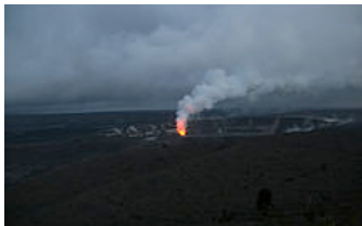
SO 2 Plume