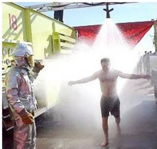
Mass decon: