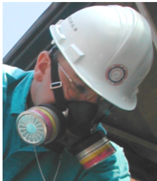
½ face respirator with P-100/OV/AG cartridges

If in doubt about respirators, see your Supervisor!