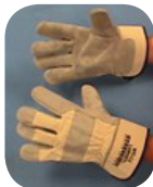
Examples of Leather Gloves