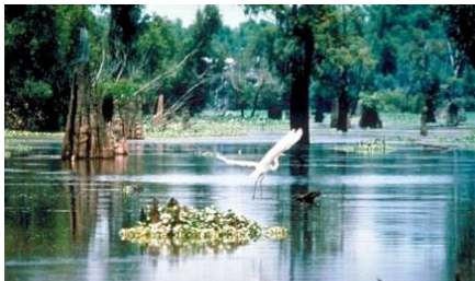
Atchafalaya Basin Scene