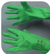
Examples of Nitrile Gloves