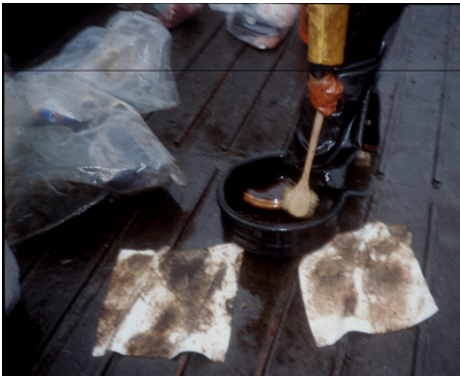
Field decon boot wash