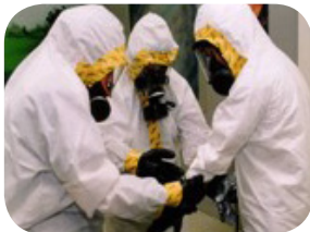
Level C PPE with Tyvek® splash suit and Air Purified Respirator (APR)