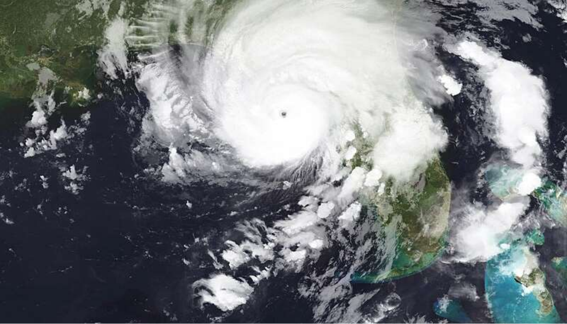
Hurricane Idalia Aug 26, 2023 – Aug 31, 2023